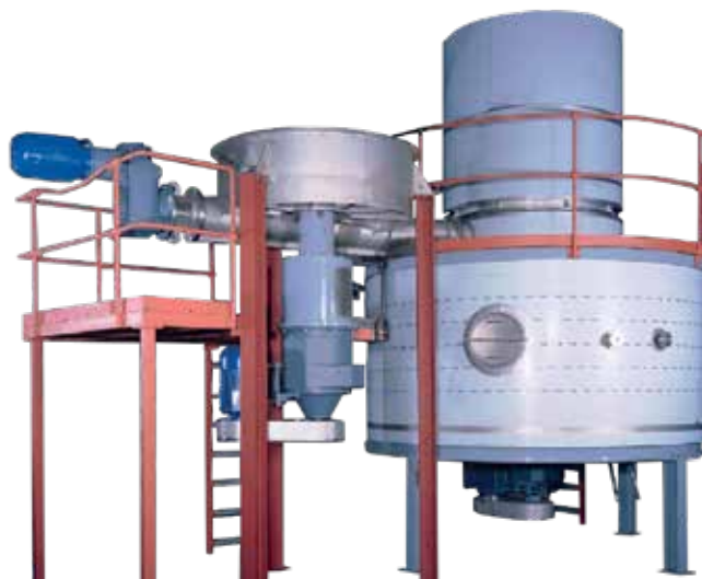
Anhydro Spin Flash® plant

Small-scale, ready-to-install Anhydro Spin Flash® drying plants are available for research purposes and small-scale production. They are simple to operate and dismantle for cleaning.