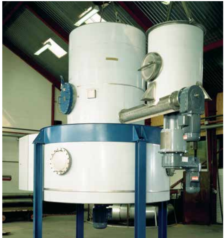
Anhydro Spin Flash® plant