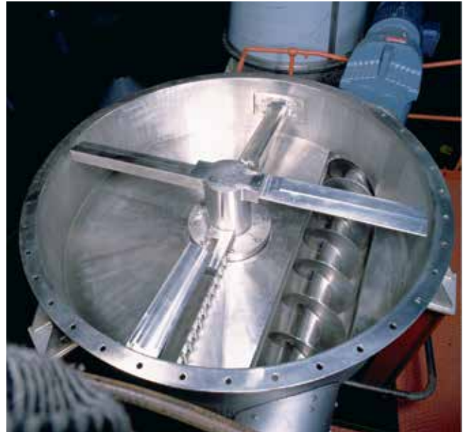
Inside view of a Spin Flash® feed vat