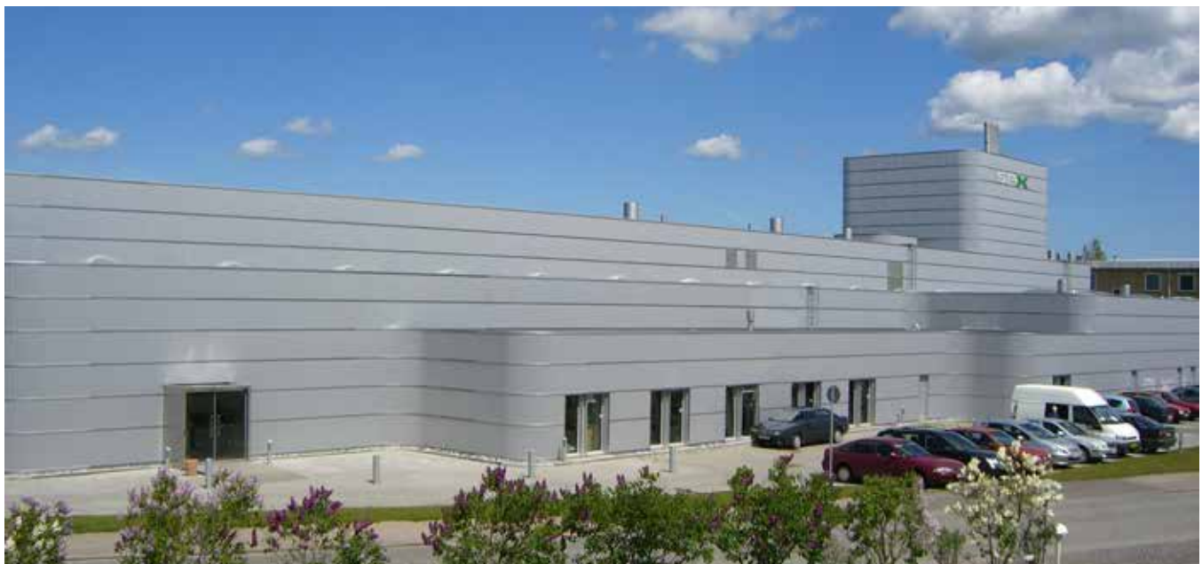
SPX FLOW innovation center in Soeborg, Denmark

Environment protection is incorporated in accordance with local rules and regulations and is a key point in the plant design. We are ISO 9001:2008 certified. All our plants meet the CE marking and ATEX requirements where applicable.