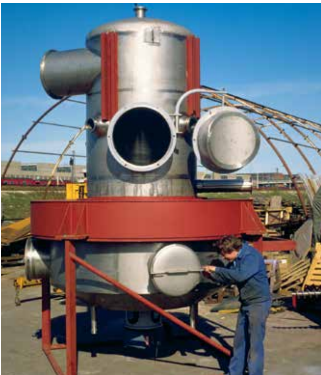
Anhydro Spin Flash® drying chamber