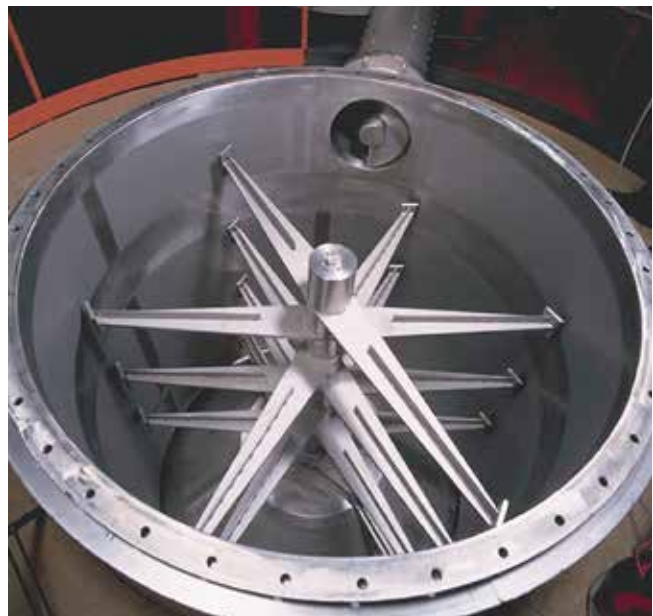
Inside view of a Spin Flash® drying chamber