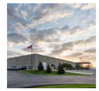
SPX FLOW pilot plant service center Delavan USA

Based in Charlotte, North Carolina, SPX FLOW, Inc. (NYSE: FLOW) is a multi-industry manufacturing leader. For more information, please visit www.spxflow.com