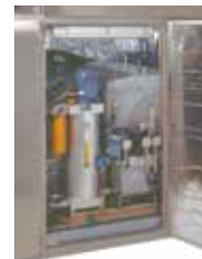
Oil and Hydraulic Units