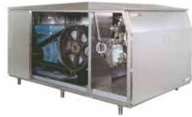
Transmission (Power End)

We will be happy to discuss any other requirements you may have.