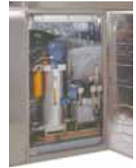
OIL AND HYDRAULIC UNITS