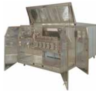
ACCESS TO THE HOMOGENISER