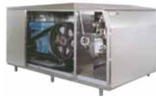
TRANSMISSION (POWER END)

We will be happy to discuss any other requirements you may have.