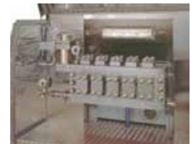
LIQUID END (GAULIN)