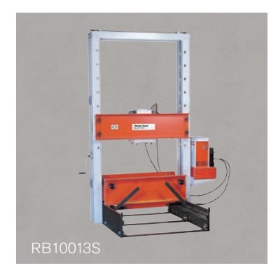
Products ordered through our European distribution center are CE compliant